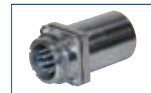
Male Inlet with Handle (Plug) 07-A8001-SS + 09-2A013-SS-34

A typical order should include an inlet part number, a receptacle part number AND the matching handles, angles or other required accessories.